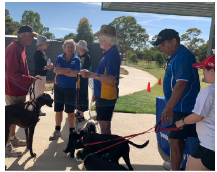
Lots of dogs completed the course with their owners.