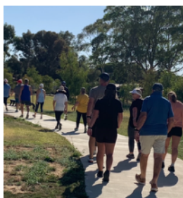
Many thanks to the Kiwanis who provided a delicious sausage sizzle.