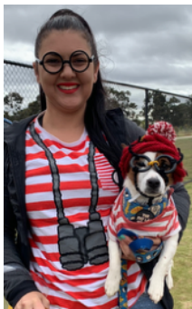
Above: Prize winner Newman and owner, dressed as Where's Wally.