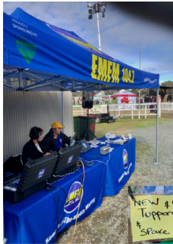
Far right: A little performer grooving to our music at the Moama Market OB on 12th June.