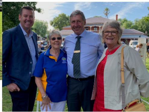
Above: Congratulations to all the new citizens.