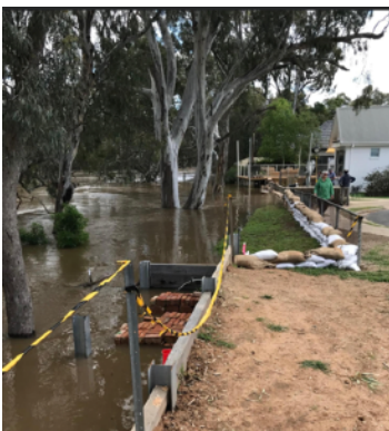
Left: The Campaspe River behind the Echuca Hotel