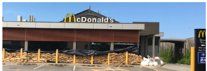
Maccas: "Do you want sandbags with that?"