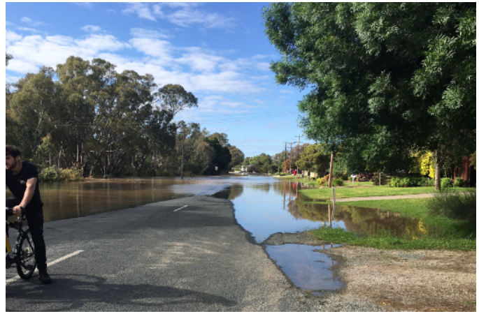
Campaspe Esplanade looking south to Ogilvie Avenue. Luckily there is no water over the road now and flooded residents have time to clean out their homes.