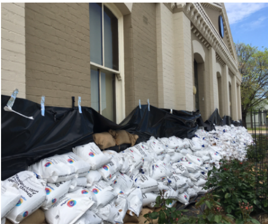
Saving the old historic library building. Luckily the levees held and the water didn't come up to it.

Radio EMFM has been broadcasting updates with flood information during the recent floods, and publishing reports on our Facebook page with links to the websites of relevant organisations. We hope our listeners have found these updates useful. In addition, presenters have been providing this information and other community service announcements (CSA's) with regard to events and cancellations in the course of the normal programs.