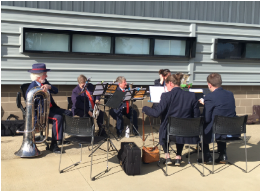
Left: Echuca Federal Band.