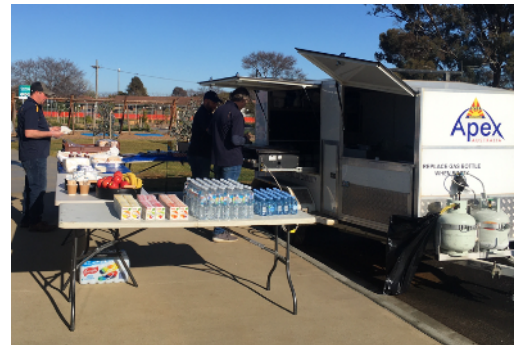
Right: The Apex club provided a BBQ and refreshments.