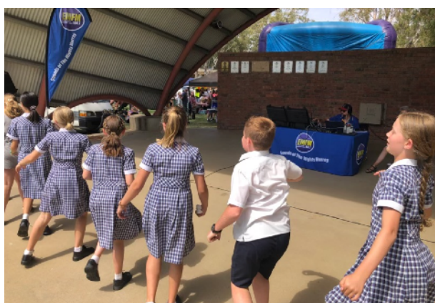
Students doing the Nutbush at our Outside Broadcast at the Moama Market. 13/02/22