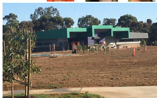
Lawn going in at the Echuca East Community Precinct. Nearly ready!