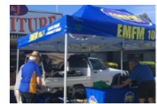
OB's soon? Hope so.